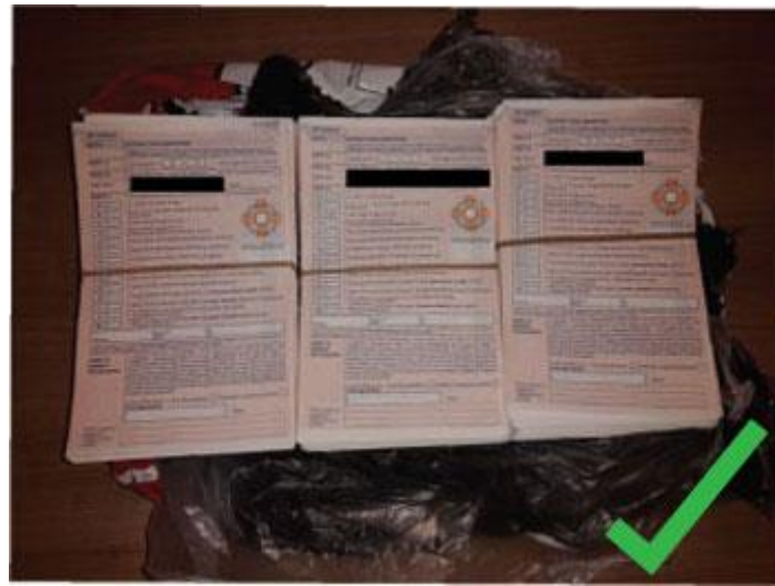
Secured blocks/bricks of forms secured with rubber bands