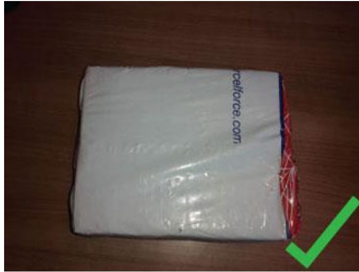
Tightly secured package